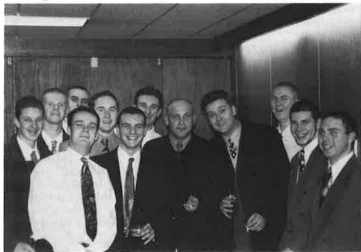
The 4th's in the directors suite at Burnley F.C.