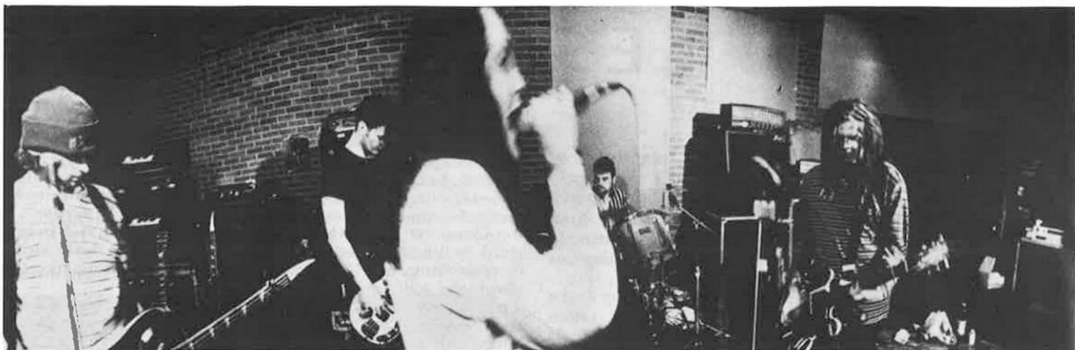
ned's atomic dustbin